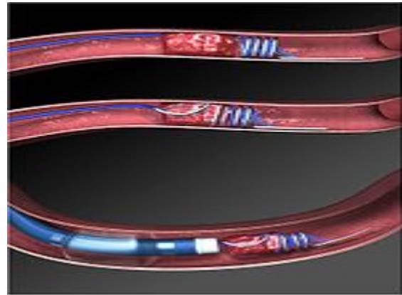
Figure 3: Mechanical Thrombectomy.

Thrombolytic agents restore cerebral blood flow in some patients with acute ischemic stroke and may lead to improvement or resolution of neurologic deficits. Unfortunately, thrombolytics can also cause symptomatic intracranial hemorrhage. Therefore, if a patient is a